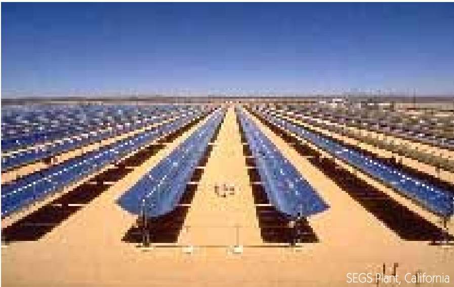
SEGS Plant, California